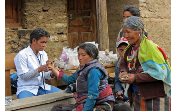
The amchi is informing and treating (o) / First marriages and children (u)

sure, lung diseases and gastro-intestinal diseases. The many treatments he performed make clear that impartial of religion the local population have deep trust in the Tibetan medicine. The demand for further visits of renowned Tibetan doctors is large, while at the same time the support of local experts in Tibetan medicine is necessary.