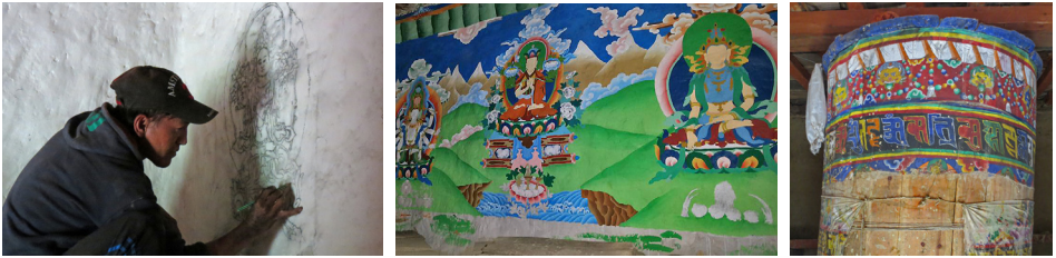
Making of the murals in the prayer wheel house in Pugmo