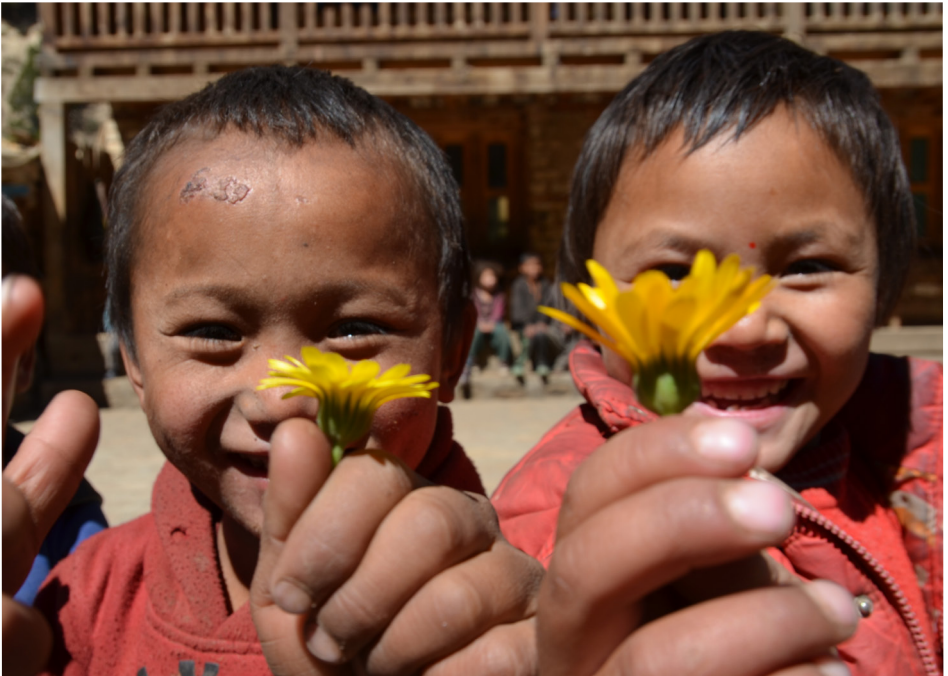
Tapriza's flower children

TAPRIZA SCHOOL & PROJECTS IN DOLPO – NEPAL